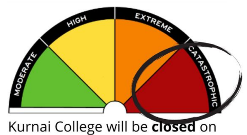
days of Catastrophic (Code Red) Fire Rating

This is a change to previous years, and we ask families to be aware of this in preparation.